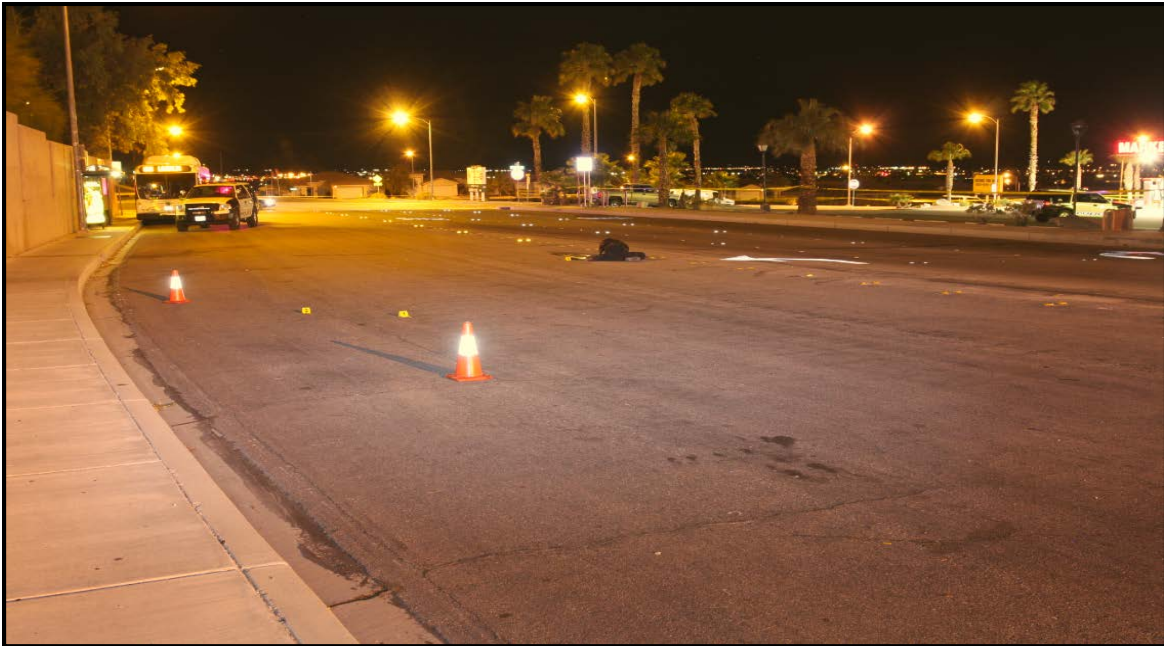
James A. Bilbray Parkway