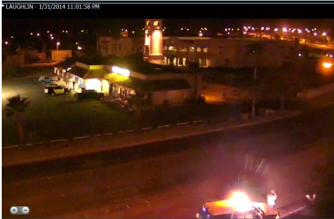
Video surveillance from the TASS camera mounted north of the scene