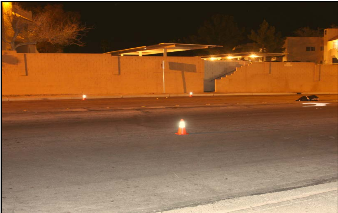
Block wall lining the North side of the scene