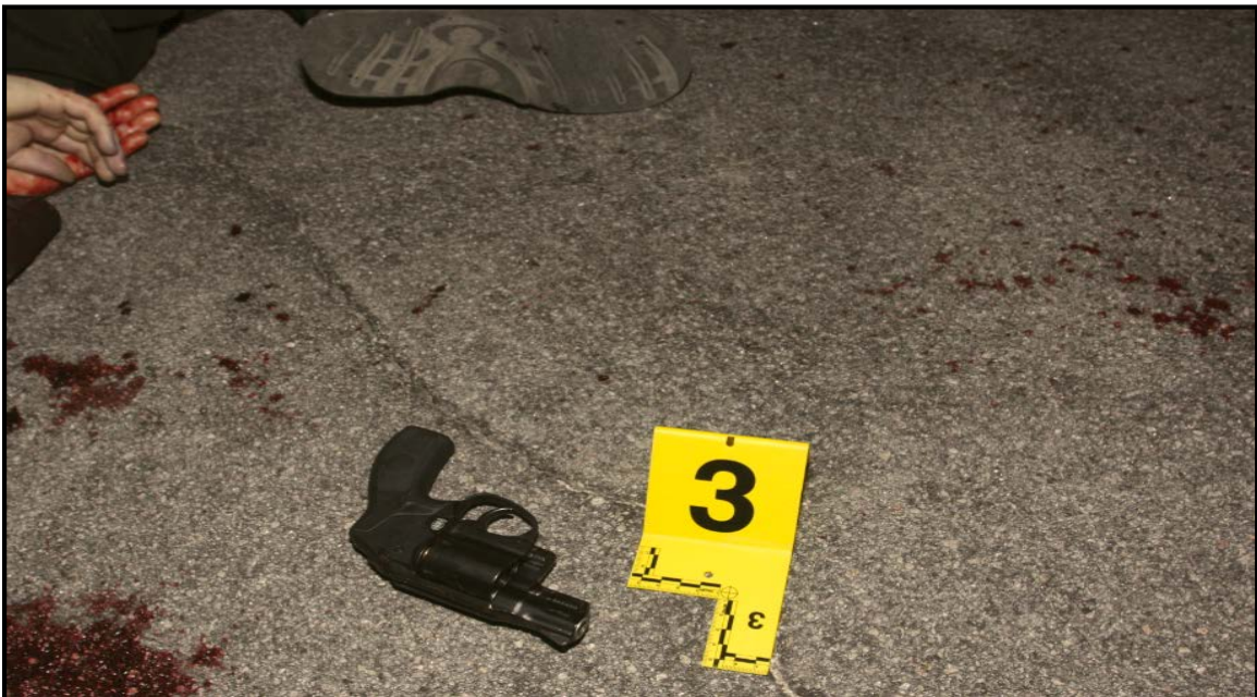
Decedent's Smith and Wesson BG Bodyguard five shot revolver